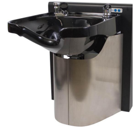
Above: Electric Comfort Fit Shampoo Bowl

Together we will light up our Nursing Home trees recognizing each name being honored on the tree. Each light and ornament will honor an individual, family, group or organization. Individuals may choose to celebrate the birth of a child, show sympathy upon the death of a loved one, in honor or memory of a friend, family member, neighbor or coworker or just to let others know you are thinking of them by designating a Light of Love.